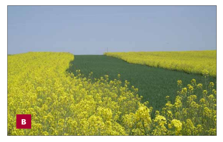
Figure 2. Winter canola and wheat at A) emergence, B) bloom, and C) maturity.