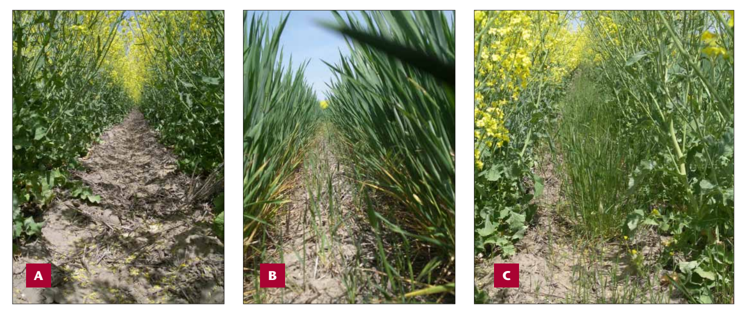
Figure 1. Weed management approaches for growing winter canola and wheat. A) Grassy weed control in winter canola with Roundup (Group 9). B) Grassy weed suppression in winter wheat with Osprey (Group 2). C) No herbicide application in winter canola.

stand establishment with a small seed under limited soil moisture conditions, harvesting a new crop with a much smaller seed than wheat, and changing marketing strategies. Research was therefore conducted to help producers determine the market prices needed to offset these risks and increase profitability, as well as improve weed control through the utilization of non-Group 2 herbicides.